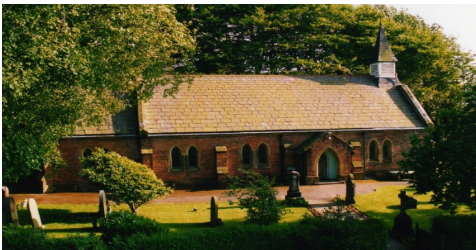
St Michael Weeton

Parish Profile for the United Benefice - May 2026