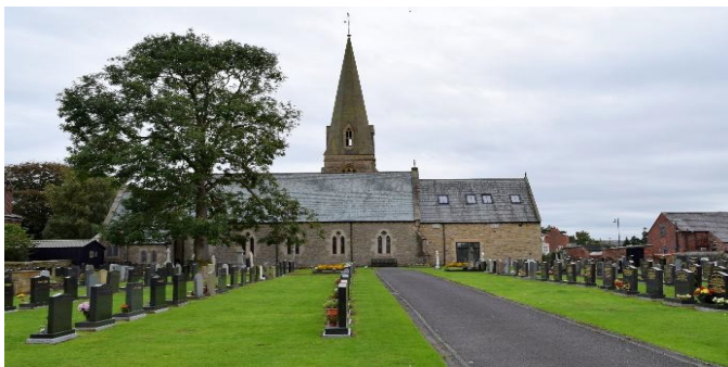
Rear of Church with the Community Centre to the right

St Nicholas Church was consecrated in 1855. A tower was added to the south elevation in 1885 and the Lychgate was erected in the early 1920's as a WW1 memorial. The Church is regarded as one of the most attractive in the area and is open each day of the year for visitors. The Church has a heritage Grade II listing. The building is in an extremely good state of repair with continual maintenance being achieved. The last quinquennial report was November 2025 with no major problems or repairs highlighted. Our church bells were renovated 2 years ago and we installed a new PA/sound system at the same time.