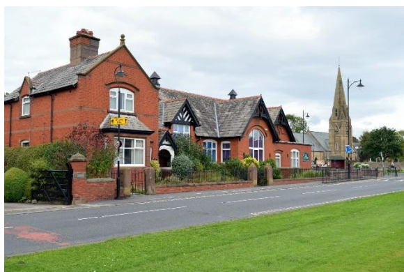
Wrea Green Primary School