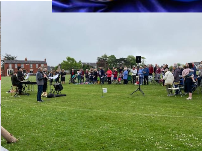
Service on the Green