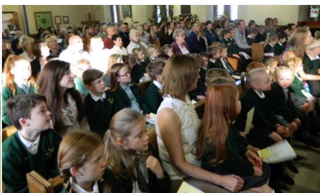
School leading Harvest Festival

Ribby-with-Wrea is a small Church of England Primary school situated at the heart of the village of Wrea Green. We have a history stretching back to 1693 and are very proud of the important role we hold in the life and work of the village.