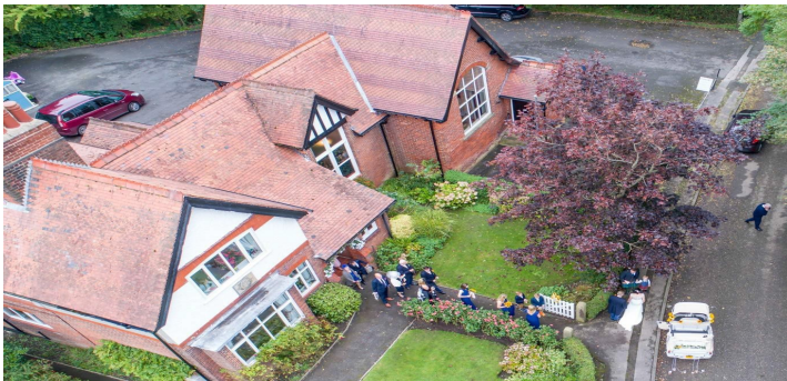
St Matthew Ballam