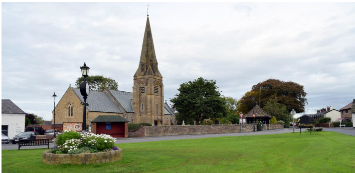
St Nicholas Ribby-cum-Wrea